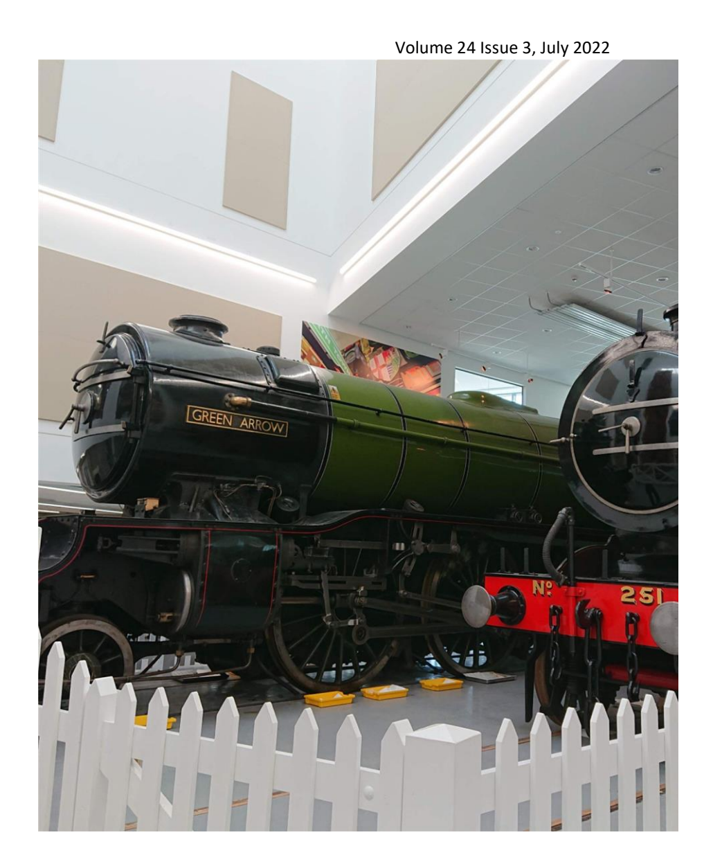
In this Issue