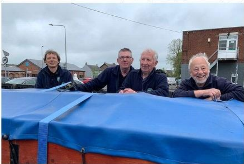
Ackworth Gala day saw Thunderbolt in action and resulted in a design rethink for the riding car.