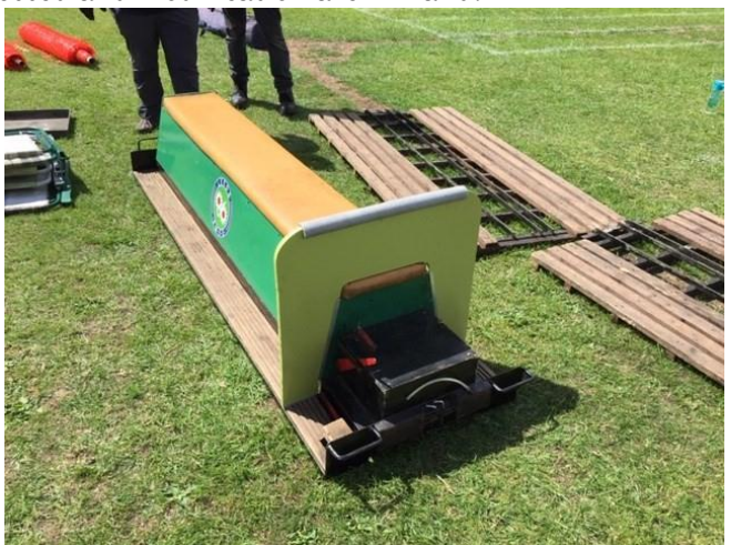
Modified Portable Track Riding Car

The railway has performed well at various country galas making a good income. A new loco to the roster has caused a lot of interest in the shape of Mark's Thunderbolt. With the loco being ride on it has necessitated a mod to the truck to prevent passengers sitting too far forward. This has been addressed and modification are in hand.