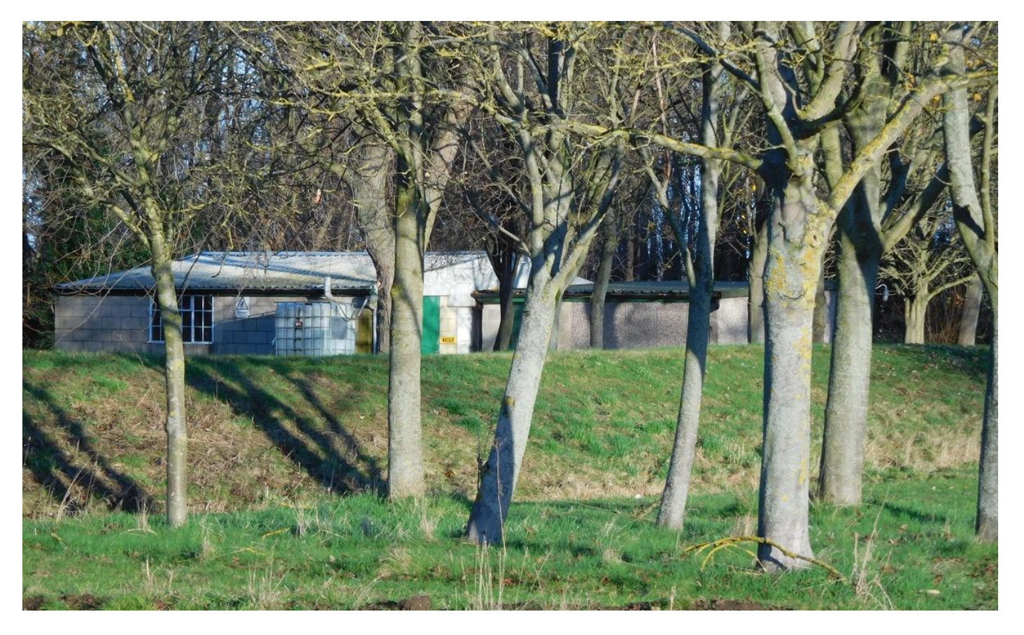
The tunnel too is still intact.

In the distance, we could see our old clubhouse still standing: