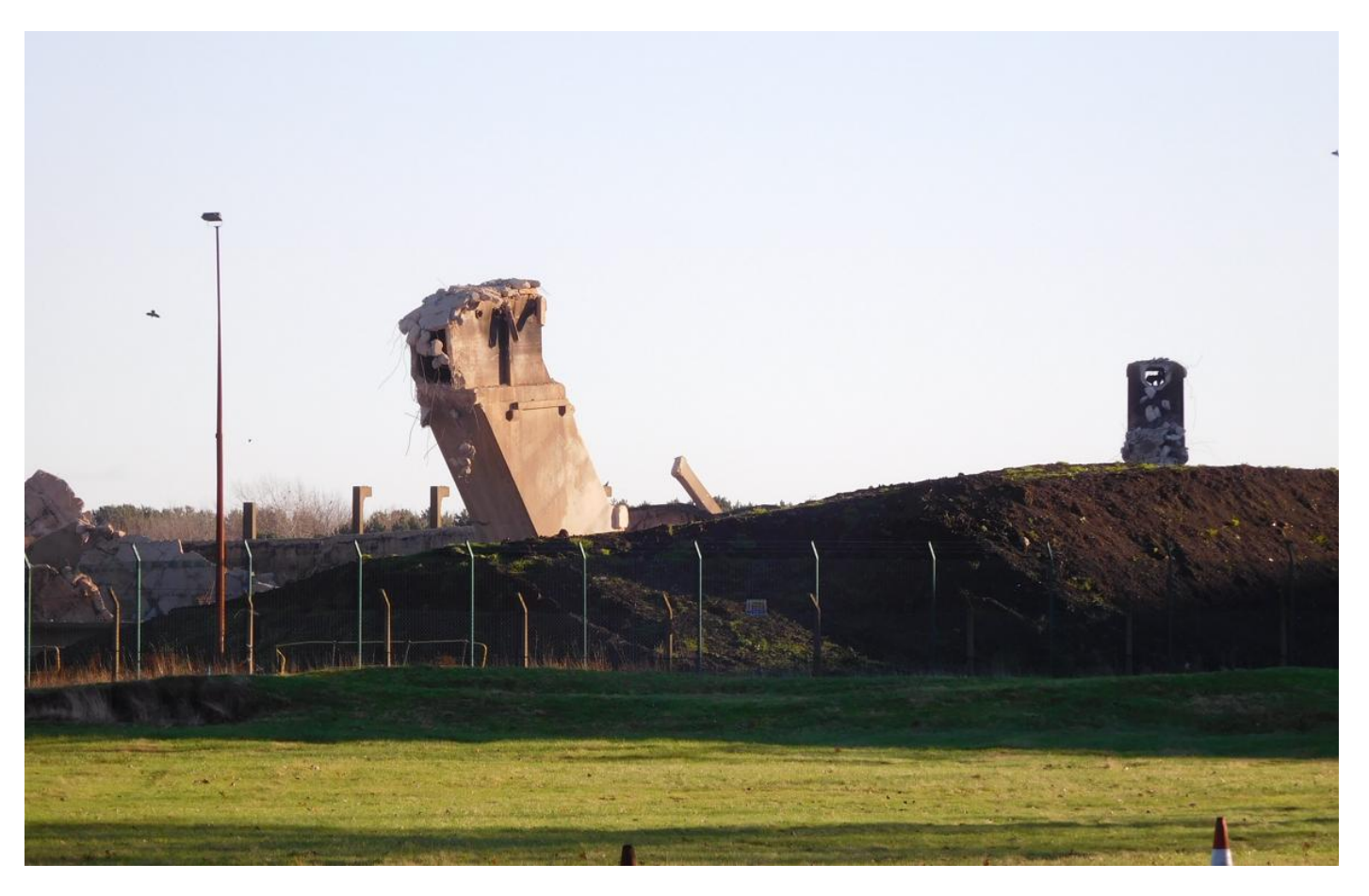
So having curved round the other end of the conifers, the track will curve right and then head towards the centre of the two pylons.