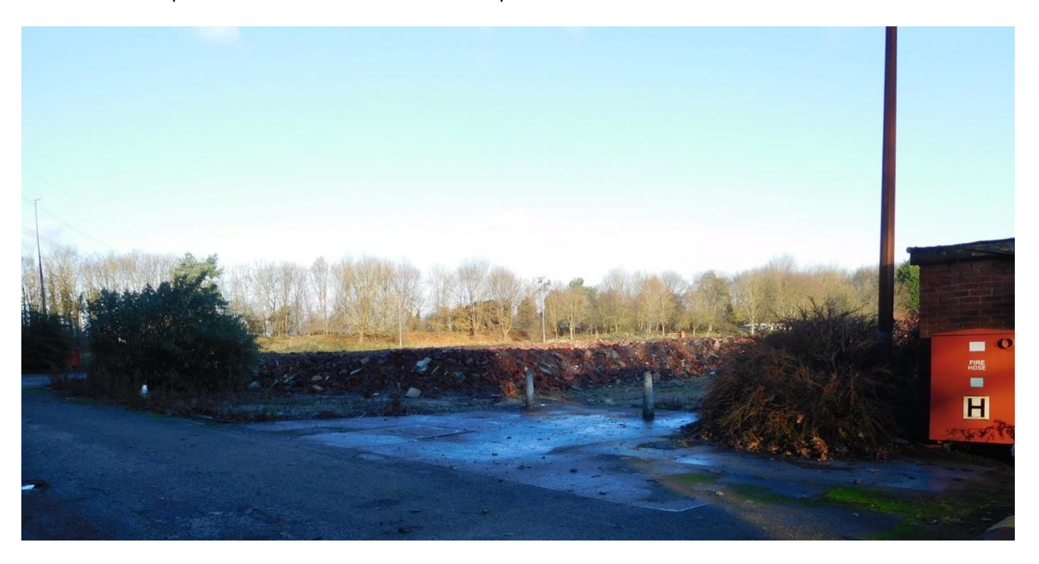
The bowling green isn't looking as well-kept as it used to do...

As we were on site, I took a few photos so people are aware of what it looks like now, and more importantly, the area where we hope to be. Here is what used to be the Sports & Social Club: