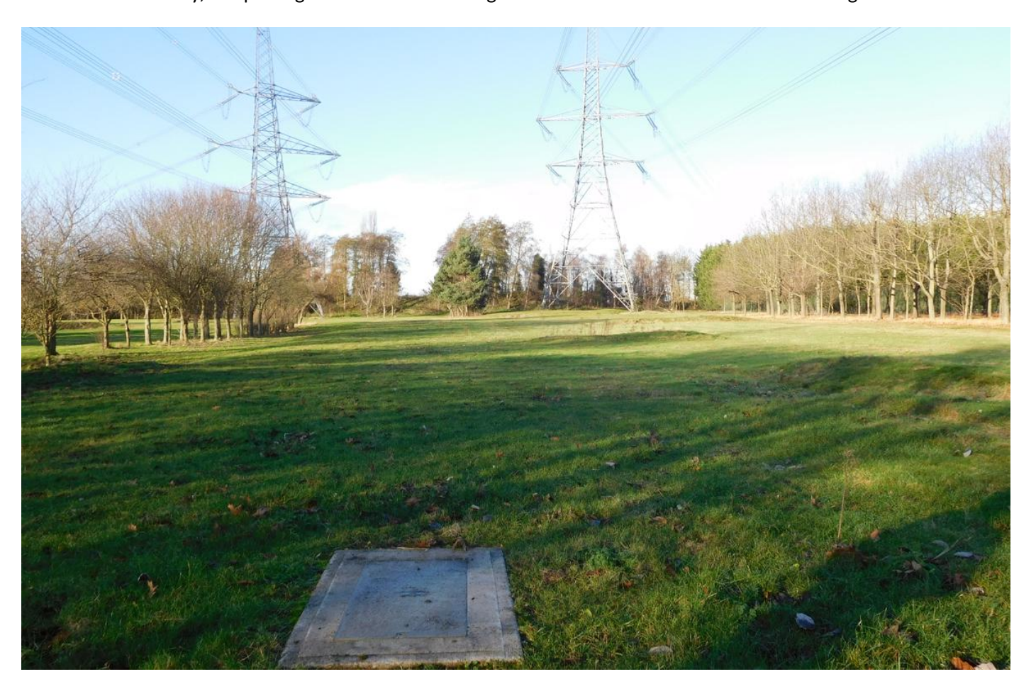
Ground levels here are a bit varied; we should be OK as we're on the higher ground to the right.

We were able to find the line of the National Grid "Easement" that is shown on their diagram; it looks as if we can cross it with a railway, but putting a clubhouse or carriage shed on it – or close to it – will not be a good idea.