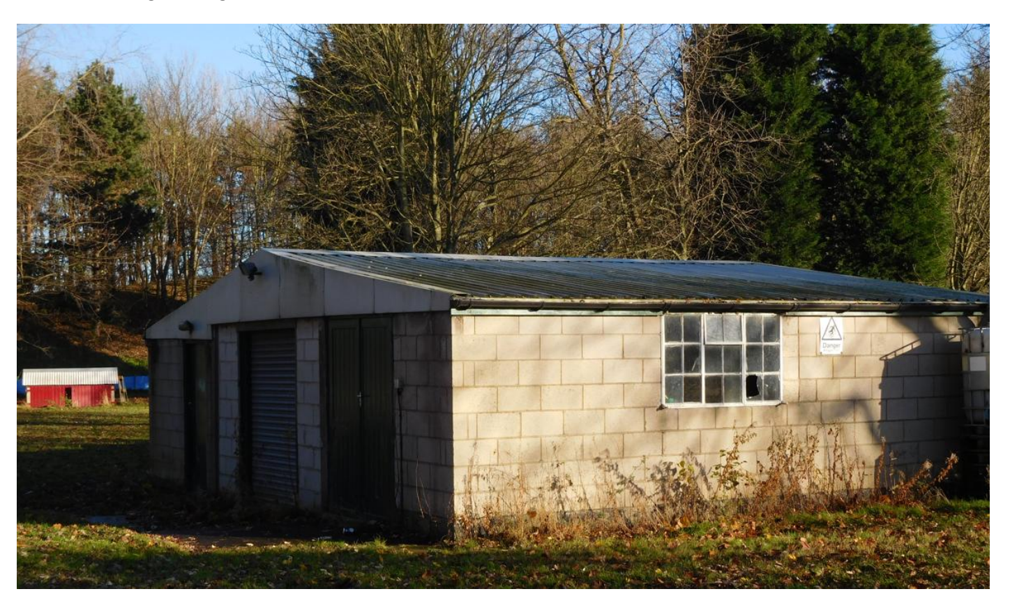
But inside, apart from the smashed door frame and broken window, it was pretty well as we left it...