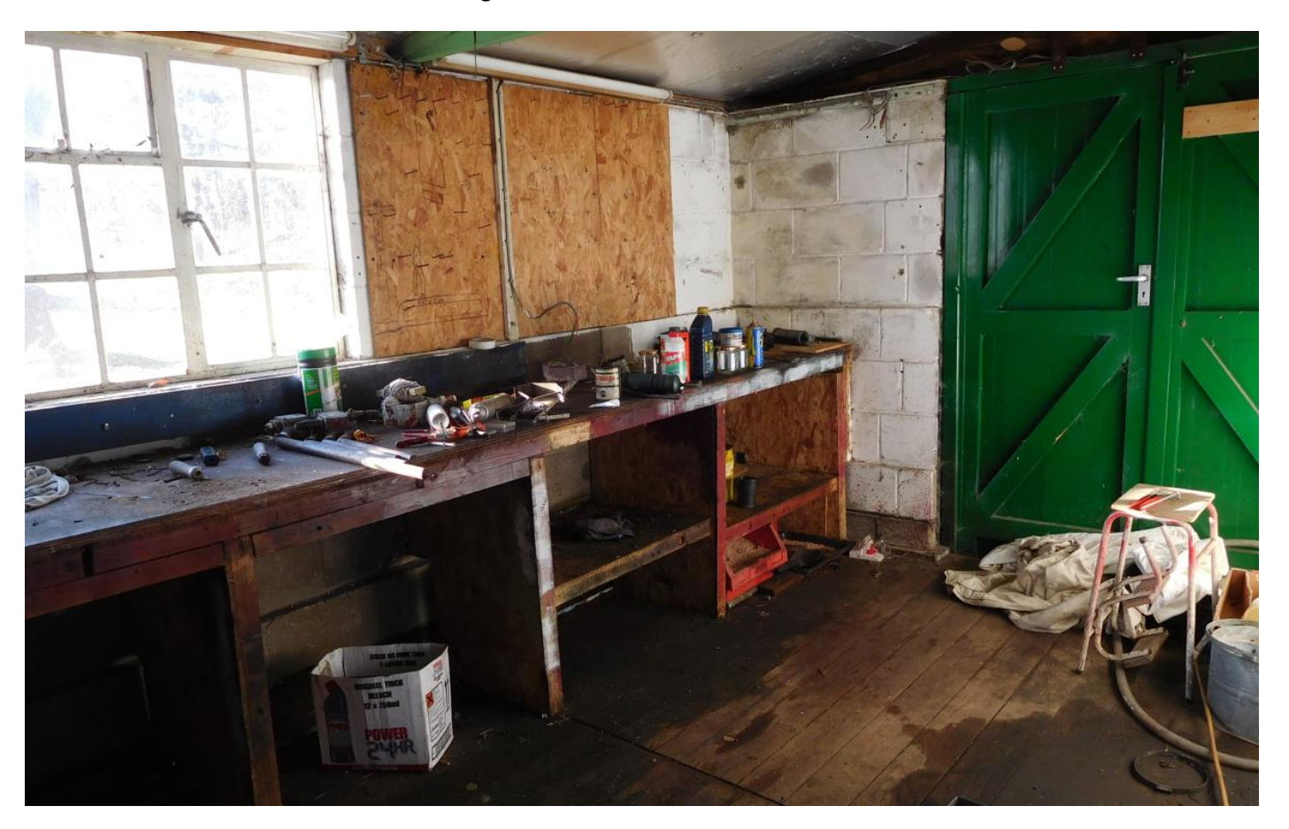
"Cse of Old Rly" as it used to say on OS maps...