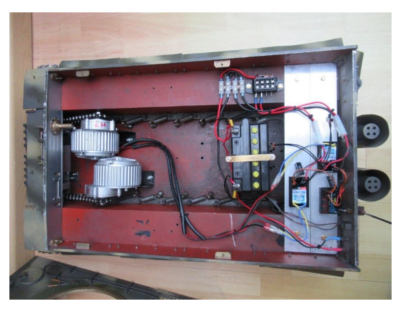
Speed Controller and Fuse Holder Wired Up