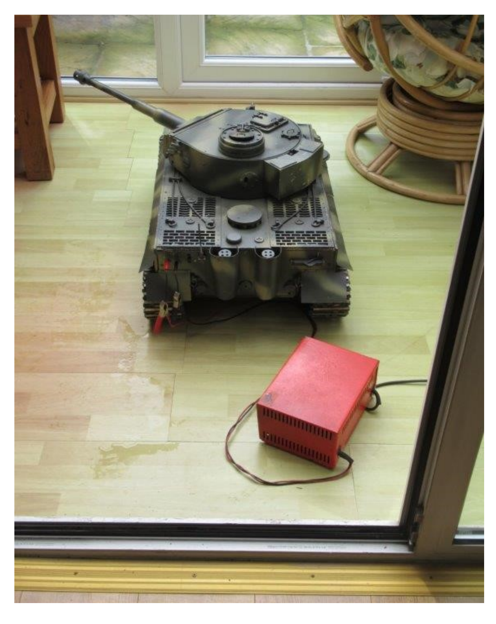
Refueling, these Tigers are thirsty.