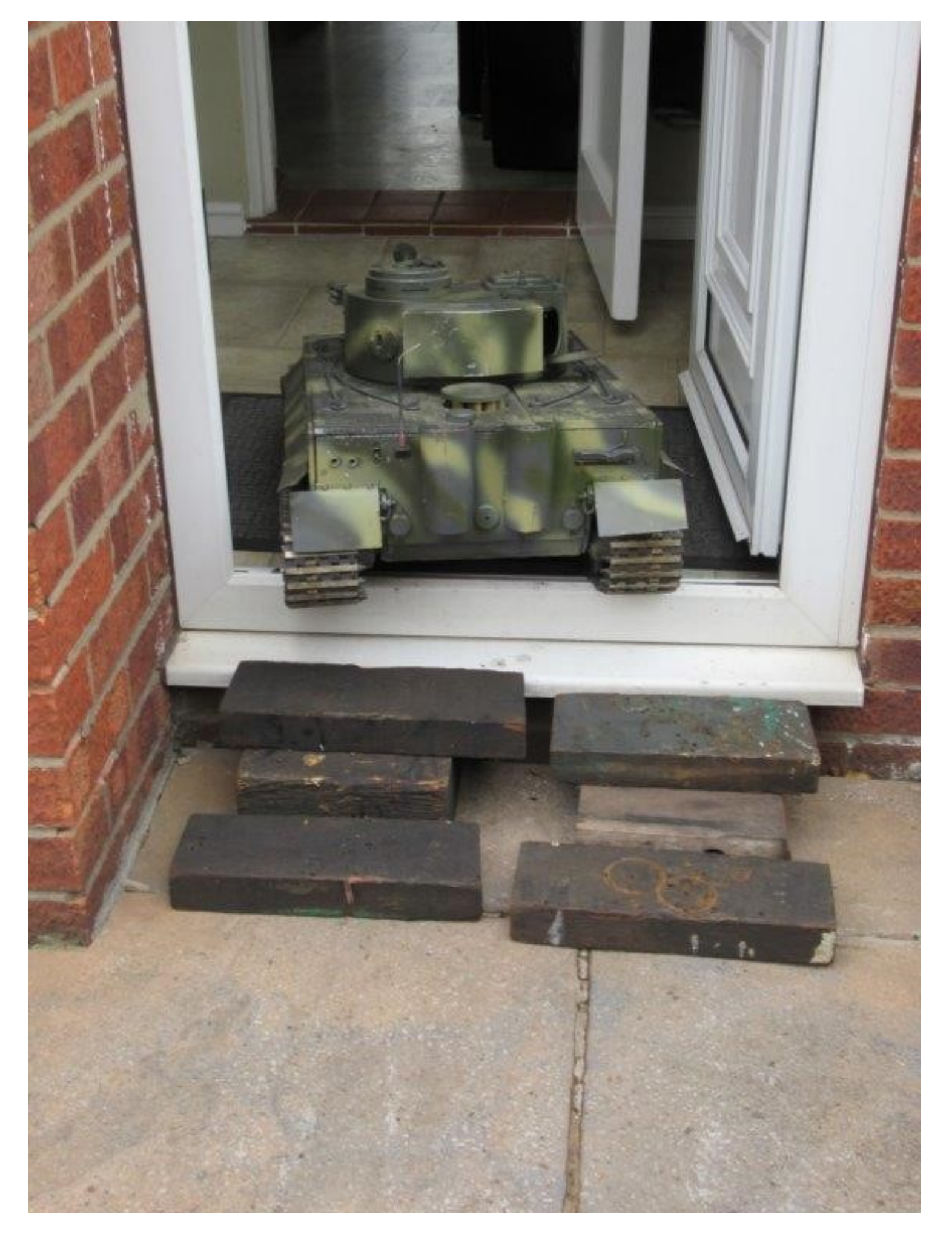
Climbs Into the House