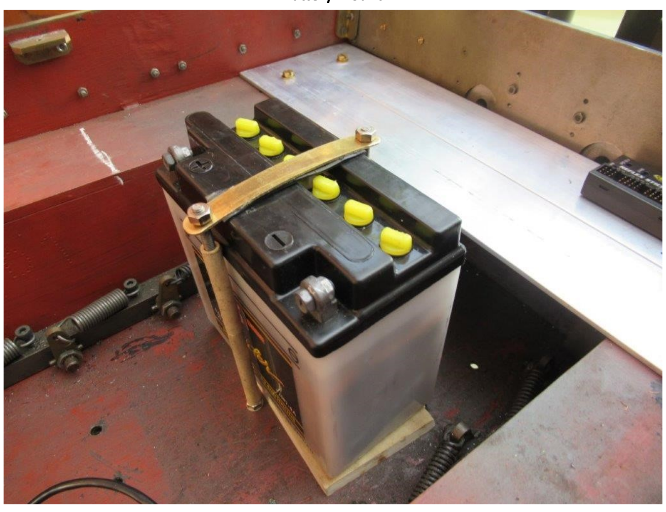
Battery in Place