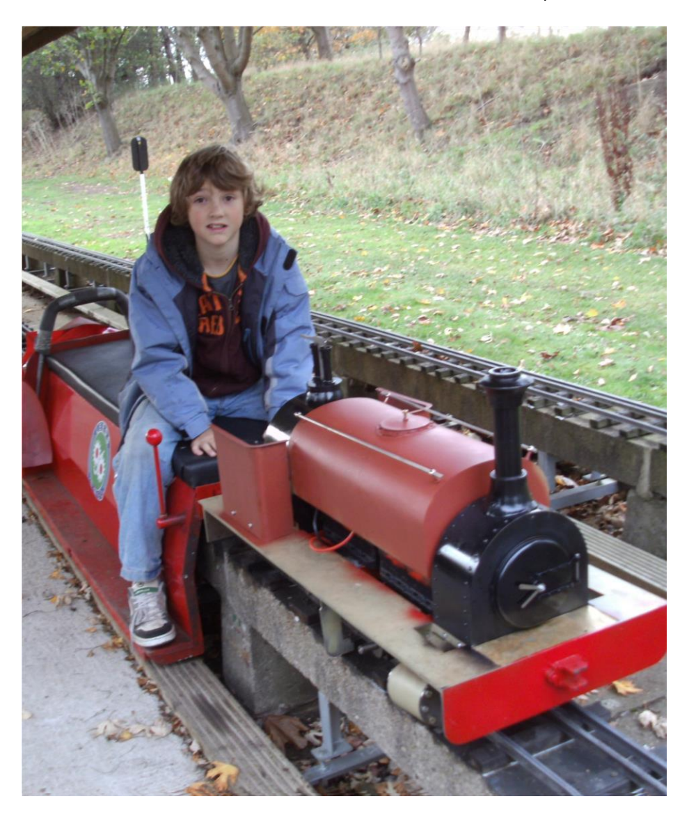
In this Issue