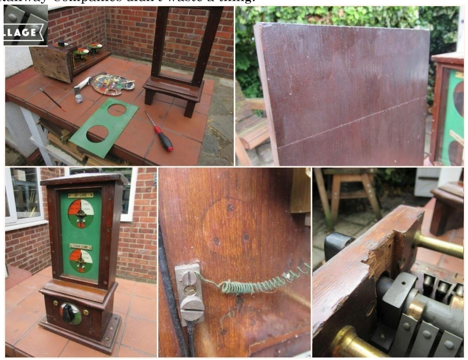
Dates for Your Diary - July - November

Anyway see what you think of my conclusions, it goes to show that the old Railway Companies didn't waste a thing.