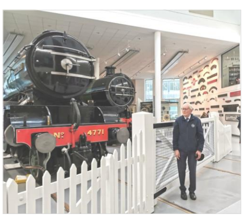
The new museum includes the facility to display two locos on loan

Any suggestions for venues for Breakfast Outings are most welcome, especially if the suggester is willing to be involved in the organisation!