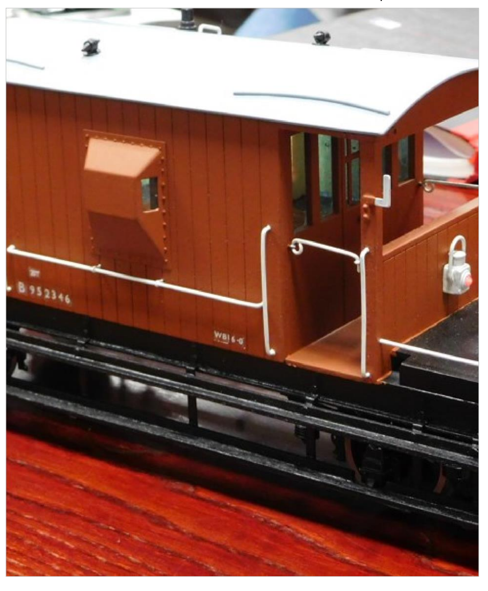
Volume 26 Issue 2 April 2024